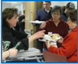
Sample Taste Testing