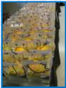
Goody Bags from FruitTastic