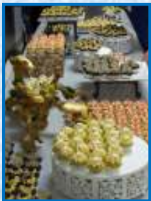
Desserts to Sample