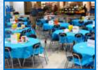
Reserved Dining Area